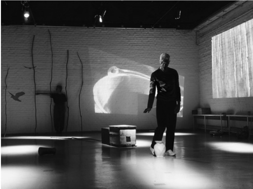
Fig. 1.1: Performance documentation. Promenade 7: A Theatre of Memory . Zagreb, 2018.

EK: This came at a time when the choreographer Merce Cunningham (1919–2009) had said ‘no stories, no emotional baggage, we just want movement’. What was put into galleries was bodies moving.