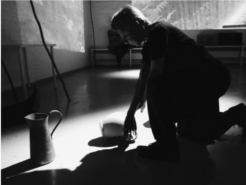
Fig. 1.4: Performance documentation. Promenade 7: A Theatre of Memory . Zagreb, 2018.

SR: How has your working together influenced your practice as individuals, in other work with other people, and as collaborators together?