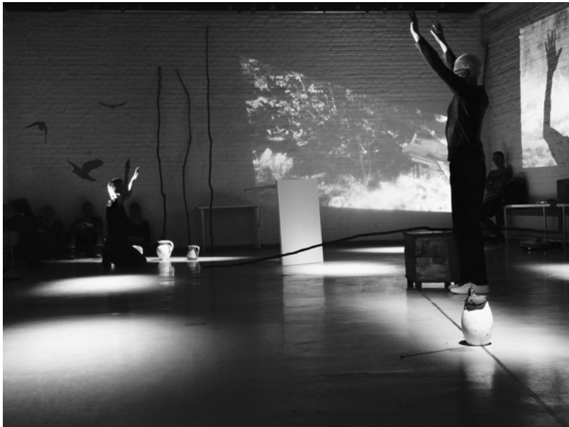
Fig. 1.3: Performance documentation. Promenade 7: A Theatre of Memory . Zagreb, 2018.

CC: These projected images always add an extra spatial dimension to the work and they also add content, often related to the setting, and they also partially light the piece.