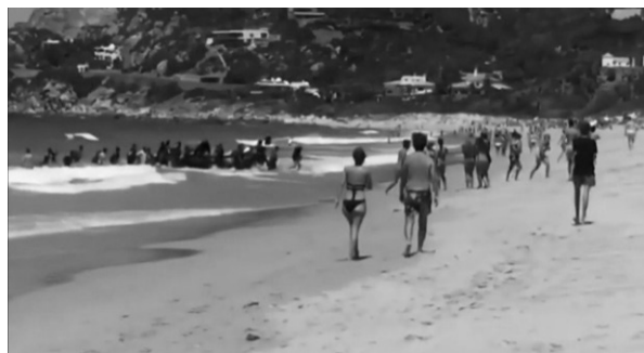
Figure 2: Dozens of migrants land on the Spanish beach of Zahara de los Atunes, Aug. 9, 2017

Tourists on the beach of Zahara de los Atunes in the south of Spain were shocked when a boat carrying dozens of African migrants landed in front of them. 10 The landing took place on August 10, 2017 near Cádiz, 7.7 miles from the coast of north Africa. Footage shows the migrants jumping out of a black inflatable dinghy and running across the beach after crossing the Strait of Gibraltar. By the time the authorities arrived, the group had dispersed and left the beach. “Migrants do not usually disembark on Spanish beaches but it has happened before, especially near the Spanish enclaves of Ceuta and Melilla, close to Morocco.” The main question arising from the “tourist body-fields” – such as the beaches – is about the social construction of Western time , especially if it is referring to the local time of mobilities and settlements, identities and strangeness. Time is a basic element for both individual and social memory. The temporal aspect of memory is a principal regulating factor, both for individuals and societies.