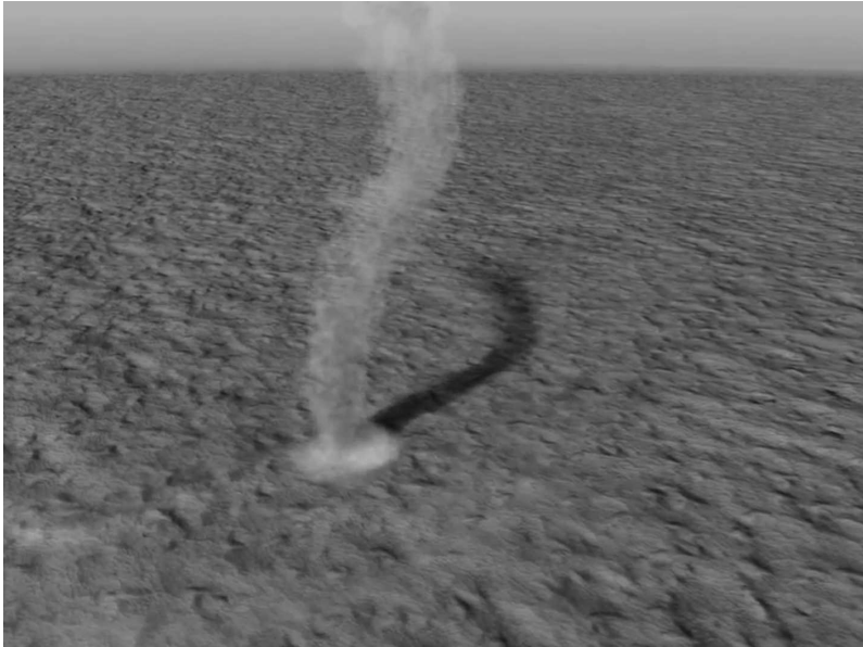
Fig. 2. Dust devil on surface of Mars and its shadow photographed from Mars orbit.

Measurements of a regional dust storm obtained by the Viking Orbiters in 1977 led to an estimate of the mass of atmospheric dust associated with this regional dust storm of about 430 million metric tons of dust (Martin, 1995). Viking Orbiter measurements were also used to deduce the mass of atmospheric dust associated with a localized dust storm near Solis Planum as about 13 million metric tons of dust lofted into the atmosphere (Martin, 1995).