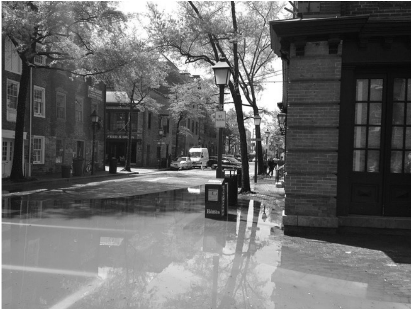
Figure 1: Street flooding is common in Alexandria Historic District during high tides and storm events.

Not only are a municipality's critical public safety and transportation facilities threatened by sea level rise impacts along tidal shorelines, but also, the economic stability of residential and commercial neighborhoods, and the longevity of significant historic resources that establish an area's cultural heritage. An estimated 15% of National Register listed properties in coastal states are at risk of damage or destruction due to sea level rise impacts within the next fifty years. 3