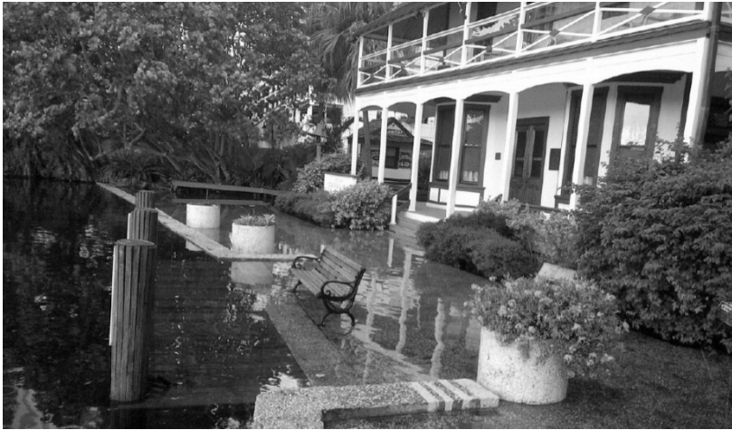
Figure 1. The seawall at Fort Lauderdale's Stranahan House now routinely floods due to rising sea level, most noticeable at the full moon high tide. Built in 1901 it is the oldest structure in Broward County.

This is only the beginning. The trends of warming, melting ice and rising seas will almost certainly continue for decades, due to the fact that the oceans absorb and store most of the excess heat. In general warmer temperatures, more extreme weather conditions, and flooding that is more frequent and more extensive pose very real threats to historic structures and communities. This will create increasing challenges and tough decisions for curators, engineers, management, and boards of directors.