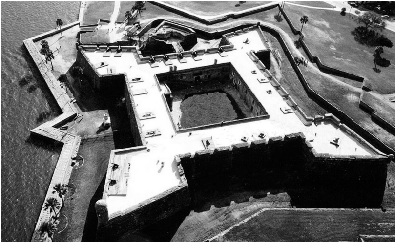
Figure 3 Castillo de San Marcos, in St. Augustine, Florida the oldest masonry fort in the continental U.S., completed in 1695 is already in the flood zone during extreme high tides. Preserving it will present a special challenge as sea level rises over the coming decades. It may present an opportunity for non-traditional approaches, including technology.

There is one new technology that will surely be controversial. Over the past few decades 3D printing, otherwise known as additive manufacturing, has made giant strides. From customized pieces to replacement parts on demand anywhere on the globe, it is seen as a game changer. Whole houses are being built via the process. Understandably many in historic preservation would find a plastic material replica to be anathema. Could it allow the possibility of very authentic looking replica's in the situations where the originals literally no longer exist, are quickly deteriorating, or must be recreated. Time will tell. It is the time to recalibrate the rules of preservation for the next half century, for as one of my heroes, Rachel Carson, said: "To understand the living present, and promise of the future, it is necessary to remember the past."