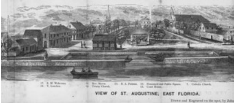
Figure 2: Seawalls have historically protected America’s oldest continuous European settlement, St. Augustine, Florida, from flooding, storm surge, and erosion. Illustration by John S. Horton, 1855, Library of Congress Geography and Map Division.

U.S. tidal shorelines to varying degrees in the next 50 years, prompting the need for new public policies and practices designed to adapt to the environmental alteration of our shorelines.