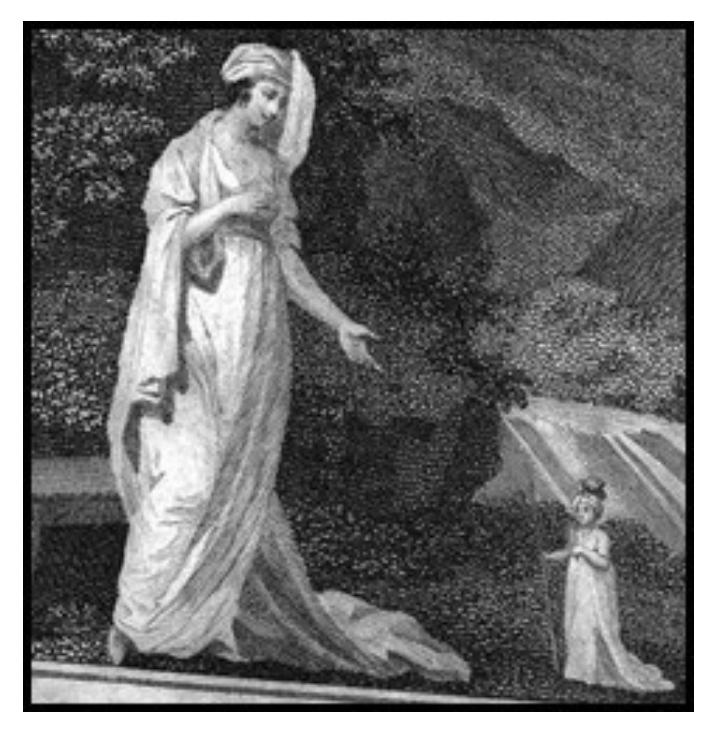
Fig. 1 Frontispiece of E. S. Pinchard's The Blind Child (1791)

An interesting aspect can be added to our collection of the vocabulary that binds together the adult, the child, eyes, vision, and seeing. Curiously, it is found in works that look the other way and deal with darkness, disability, and blindness. Literature and the arts often associate two things with unadulterated, unconditional love: perpetual infancy and blindness. The Roman Cupid was represented precisely like this, as a boy in early childhood jumping out of an enormous egg, holding a bow and arrows—a very happy child indeed, but a blind one. Shakespeare liked to toy with this idea and so did many of those who came after him. But how did late eighteenth-century literature for children link love, blindness, and the child into a logical whole, and why would an author use these elements? Is there a difference in the way they represent childhood and adult blindness, and were these also connected to an enlightened, clairvoyant state of perpetual childhood?