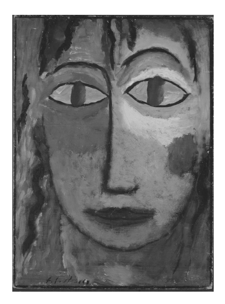
Fig. 1.3. Alexey von Jawlensky, Tête de femme "Méduse ," Lumière et Ombre," 1923, Oil/board, 16.5" x 12.2". Lyon, Fine Arts Museum.

The advent of the First World War and then the "Roaring Twenties," marked by important economic and societal mutations, could explain the decline of this antique figure. The field of artistic creation, preoccupied by chromatic experimentations, the destruction of shapes, and the birth of the dynamic movement, is prey to deep metamorphoses; Medusa does not belong to this era. It is only at the beginning of the 1960s that we witness the rebirth of the Medusean motif in a different medium—the cinema.