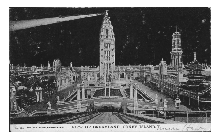
Fig. 2.2. Anonymous, View of Dreamland , Coney Island , 1906, paper with tinsel, The Strong National Museum of Play.

direct incorporation of aspects of the seven wonders into the architecture of skyscrapers can be seen in the stepped pyramid atop the Bankers Trust Building, built in 1912 by Trowbridge and Livingston, as well as the rooftop gardens of Madison Square Garden, built in 1890 by Stanford White, and the Rockefeller Center, finished in 1939 and designed by Raymond Hood. Such buildings highlight the desire of both patrons and architects to employ the theatricality and fantasy of antiquity as well as move beyond that history to conquer it in their modern building projects (Korom 2013).