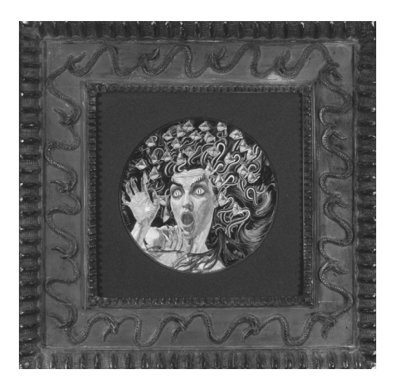
Fig. 1.1. Carlos Schwabe, Medusa , 1895, watercolour on circular paper, diameter of 6.5". Chicago, Collection of Marla Hand and Jim Nyeste.

of a human being into a monster from which escapes a cry symbolising panic and the suffering caused by the metamorphosis (Foucart, Lacambre, and Lacambre 1973, 50–1). The violent streams surrounding this aquatic Medusa underline her internal torment. The process and creation of formal beauty greatly humanise this figure of monstrous origins.