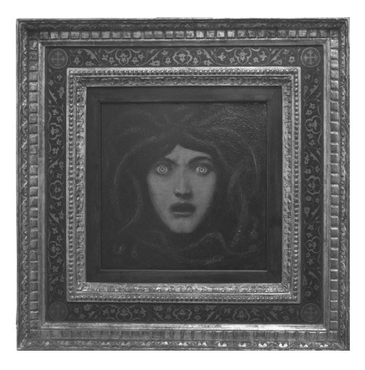
Fig. 1.2. Franz Von Stuck, Haupt der Medusa , 1892, oil/canvas, 19.68" x 18.89". Aschaffenburg, Gentil-Haus.

This latter artist painted the oil on canvas Haupt der Medusa in 1892 (see Fig. 1.2). The realism and pictorial techniques of his Medusa contrast with the one previously analysed. She has the face of a young girl and only her hair, made of snakes, remains. The pictorial precision of her crystalclear gaze and different parts of her face suggests that the artist was inspired by a photographic model.<sup>10</sup> Medusa's corpse-like aspect underlines the transparency of her look, from which the spectator, no longer horrified but bewitched, cannot free themselves.