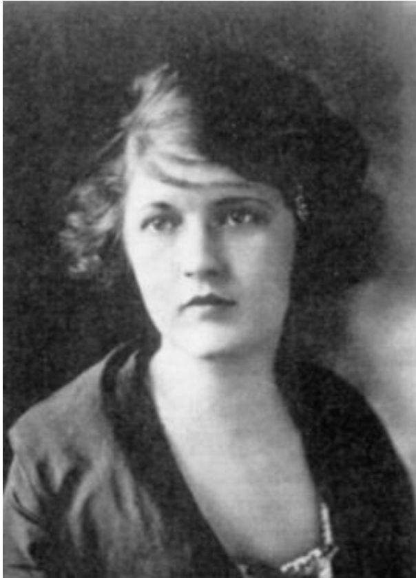
Illus.1. Zelda Sayre, circa 1919

who acted like an adolescent. She was the new woman, but not as new as some historians have maintained. The flapper was not a result of post-war euphoria, nor the advent of jazz, nor Fitzgerald's seductive creation; instead, she was a female type reflecting deep cultural anxieties about adolescent girls prevalent around the turn of the 20 th century.