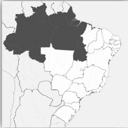
Figure 1-1: The Brazilian Amazon region.

especially in the Amazon region, which is considered one of the most important regions in the world for its biodiversity, water and mineral resources. When it comes to additional-language teacher education, things are even worse in this part of the country. For instance, in Western Pará (Figure 1-2), which is inhabited by 1,227,695 people (IBGE–Instituto Brasileiro de Geografia e Estatística, 2010), the Federal University of Western Pará (UFOPA) is one of the only two government institutions that offer a campus-based Teaching of English as a Foreign Language (TEFL) undergraduate course for the entire region.