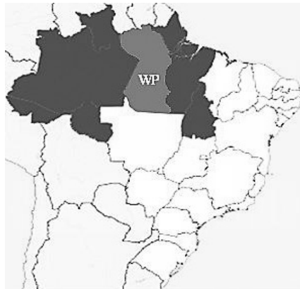
Figure 1-2: Western Pará (WP).