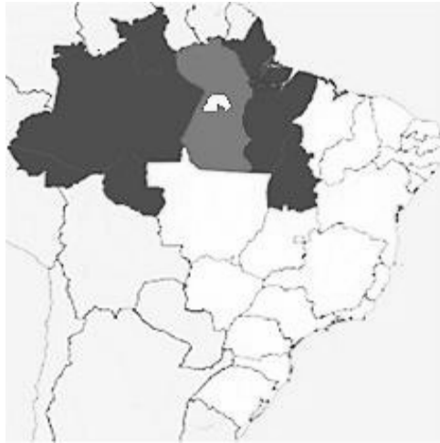
Figure 1-3: The Municipality of Santarém in Western Pará.

PLIP is coordinated by the Centre for Applied Linguistics Studies and English as a Foreign Language (EFL) Teacher Education (CELEPI), which is linked to the Language Arts Programme of the Institute of Education Sciences of UFOPA. As a whole, this sub-project aims to contribute to the continuing education of the mentors involved in it and the proper qualification of new generations of English teachers. Ultimately, the objective is to make them partners of UFOPA in its basilar mission of promoting scientific, economic and social development in Western Pará and, consequently, key players in the integration of the Amazon to the axis of the development process of Brazil from a sustainable perspective. Specifically, PLIP aims (Hitotuzi, 2012), on the one hand: