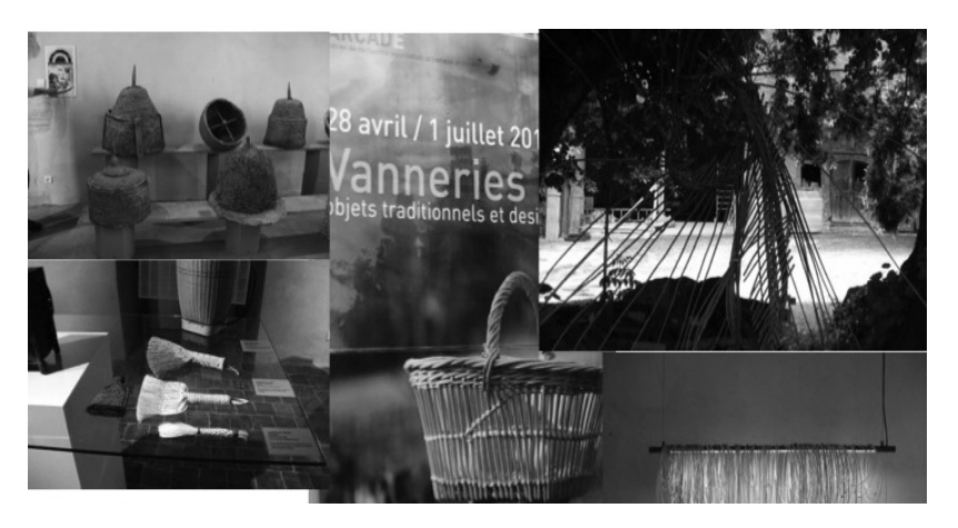
Figure 2.1. 'Baskets' theme for visual arts students, France, 2012.

at the gallery and atelier (workshop) mentor groups of secondary students for weeks at a time to teach them the professional application of art in France. Secondary schools from the region submit themed project proposals to Sainte Colombe . The curators at Sainte Colombe then review the proposals for originality, design, and local practice. Each design theme proposal must have both an artistic outlook and a genuine use within the community, that is, proposals must have both form and function. Past themes, for example, have included, 'air', 'writing', 'wine' ( grands crus ), and 'baskets' ( Figure 2.1, 2012).