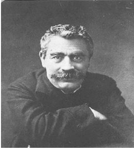
Fig. 4. Photo of Yiddish author I.L. Peretz from a postcard c. 1910.