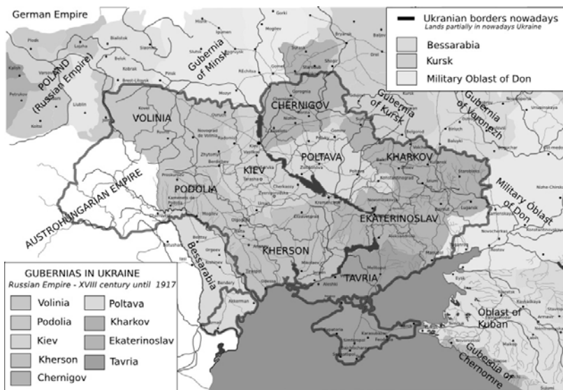
Fig. 3. Eastern Provinces of the Ukraine.

In it Idelsohn links synagogue song to all other Jewish music. He draws his readers' attention to the distinctive strength of the Eastern cantorial tradition, particularly in the southern regions of the Ukraine, where the singers from Volhynia, Bessarabia, and Podolia were recognized as more creative than their northern counterparts (see Figure 3).